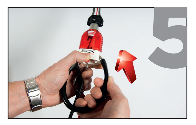
5. To re-assemble the safety system, hold the white bottom part of the quick release in your left hand and push the metal end of the chicken loop by your right hand to the hole in the quick release.