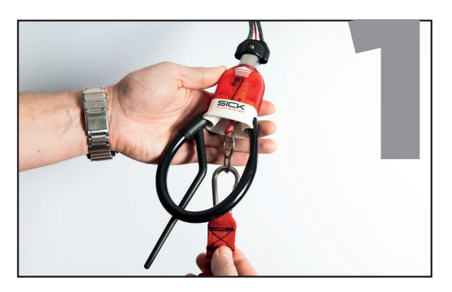
1. Always attach your kite with your safety leash to your

THESE STEPS CLEARLY EXPLAIN YOU HOW THE PUSH AWAY SAFETY SYSTEM WORKS. IT IS SIMPLE AND SAFE. FOLLOW THESE STEPS EVERY TIME BEFORE RIDING, BECAUSE THE SAFETY SYSTEM CAN GET WORN OUT AND MAY NOT WORK PROPERLY. SO, CHECK CAREFULLY IF THE SAFETY SYSTEM IS WORKING BEFORE EVERY RIDING SESSION.