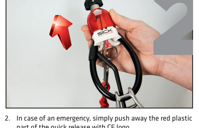
part of the quick release with CF logo.