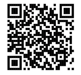
HOW TO ATTACH THE LINES