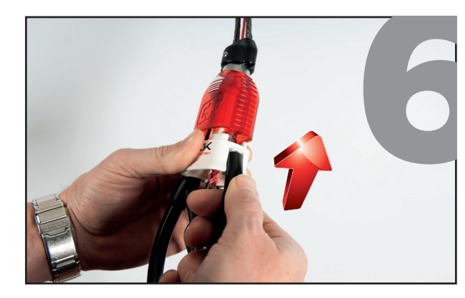
6. This pushes the red part of the quick release up and allows the metal loop to automatically click back into its original position. Now the quick release safety system is ready to use again.

MAKE SURE THAT THERE IS NO SAND OR DIRT INSIDE THE SAFETY SYSTEM. RINSE THE SAFETY SYSTEM WITH CLEAN WATER AFTER EVERY RIDE IF POSSIBLE.