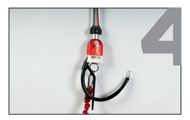
4. Now the chicken loop is opened. This kills rapidly the power of the kite. You are now connected to the kite only via the safety leash, which should also be releasable in a case of extreme emergency.